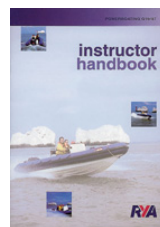
Powerboat Instructor Handbook (G19): Totally essential reading for everyone attending and considering attending an Instructor course. - £4.55