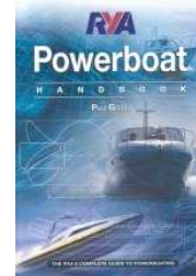
G13: The new powerboating book from the RYA is the RYA Powerboat Handbook by RYA Powerboat Trainer Paul Glatzel . - £13.65