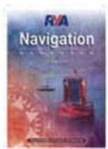
RYA Navigation Handbook, Tim Bartlett

If you are keen to do some background reading we recommend the following books: